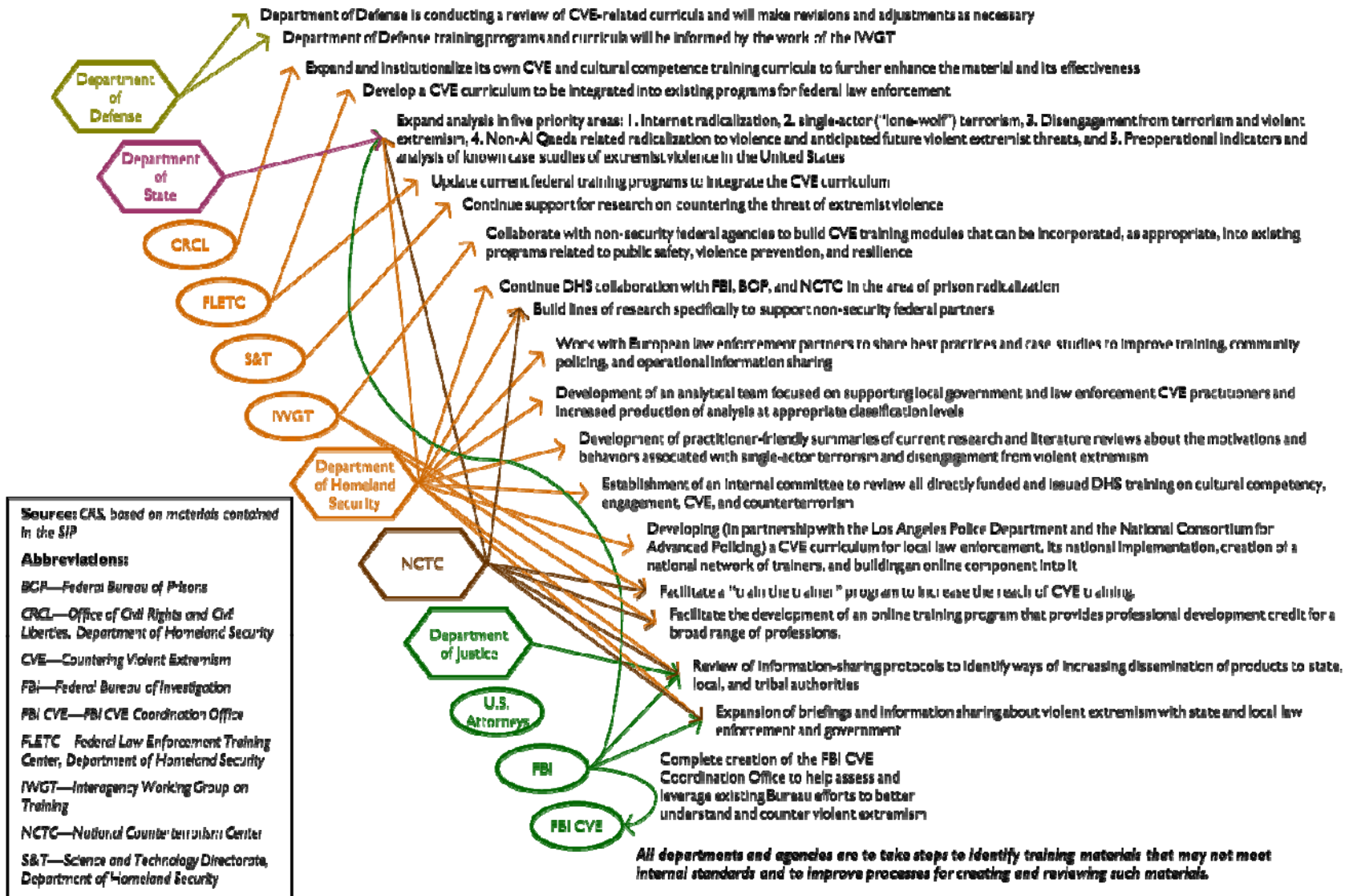
Figure 3. Lead Agencies and Their “Future Activities and Efforts” for SIP Objective 2, Building Government and Law Enforcement Expertise for Preventing Violent Extremism