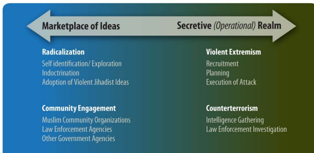
Figure 1. Counterterrorism Context